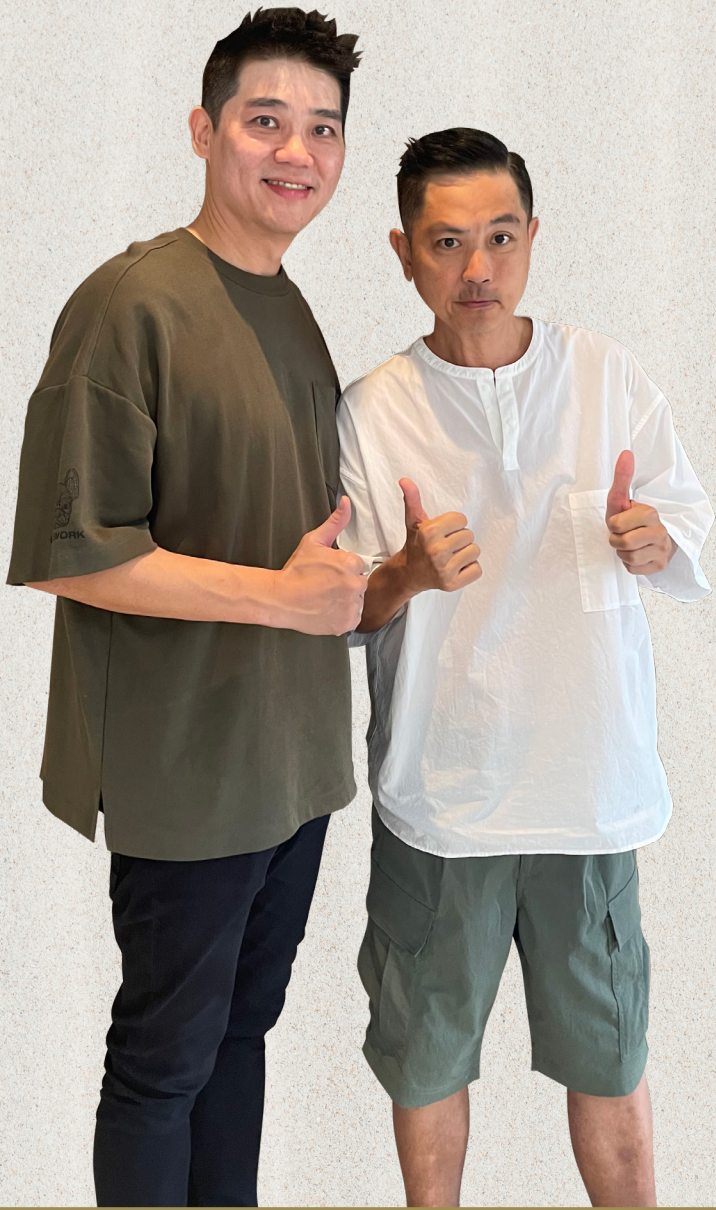
Chew Chor Meng Mediacorp Artiste